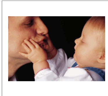
Fathers allowed to take additional leave

Employers can reclaim Statutory Paternity Pay in the same way as for Statutory Maternity Pay.