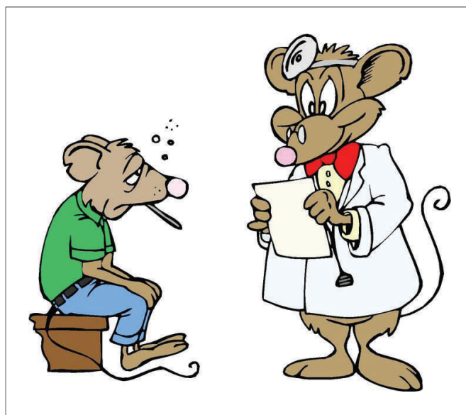
Fit Notes to Sick Notes

- What should an employer do if it receives a fit note that states and employee "may